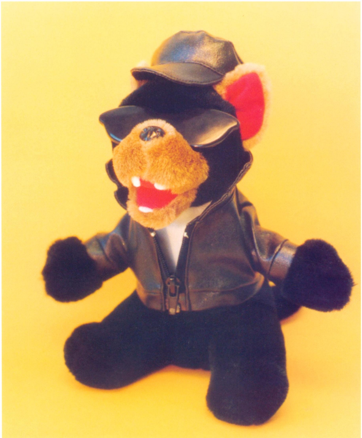
Tourist Souvenirs. (Biker "Tasmanian Devil" Soft Toy)